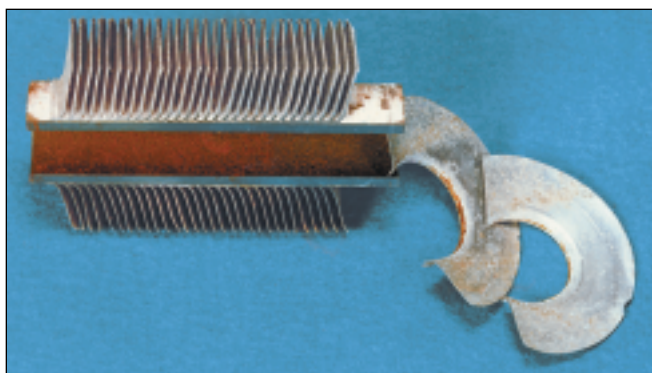
Fig. 1. Cut away view of the wrap-on fin for an ACHE.

increased thermal resistance at the tube-to-fin bond are: 1) corrosion at the fin base or root, and 2) loss of contact or bond pressure. Both conditions generally can occur over time. These problems are not likely to appear in a newly installed ACHE, regardless of the finning type.