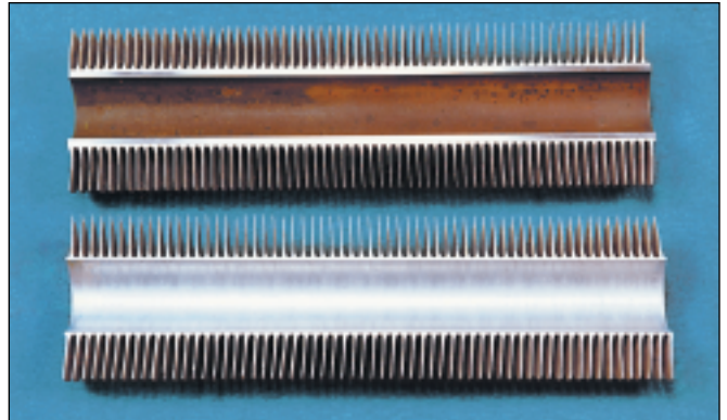
Fig. 3. Cut away view of the extruded fin for an ACHE.

machine, which first forms a small “foot” at one edge of the strip. This foot is usually a single 90° bend (“L” base) or a double 90°–180° bend (“T” base) at the fin root. The strip is then wound tightly around the tube. Tension of the fin strip is retained by stapling or clamping it with a collar at both ends of the tube (Fig. 1).